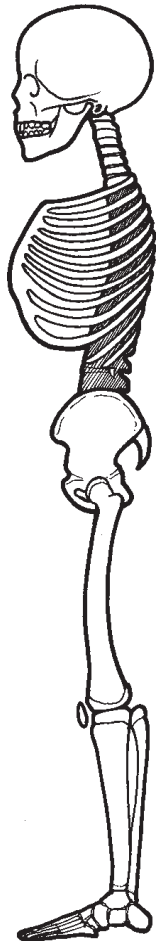
YOUTH (AGE 10 TO 13)