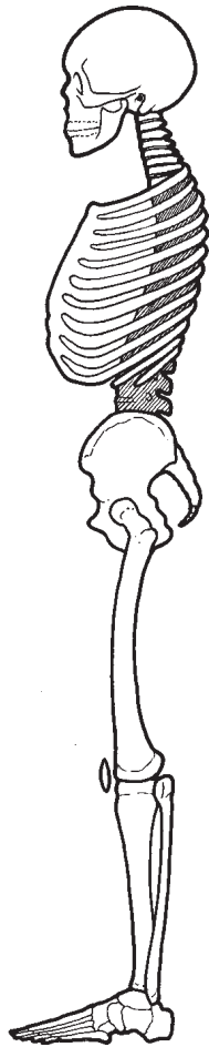
ADOLESCENT/ YOUNG ADULT (AGE 14 TO 25)