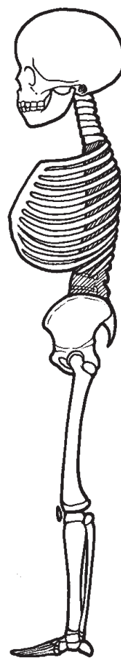
YOUNGSTER (AGE 3 TO 9)