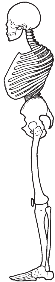
AGED ADULT WITH OSTEOPOROSIS